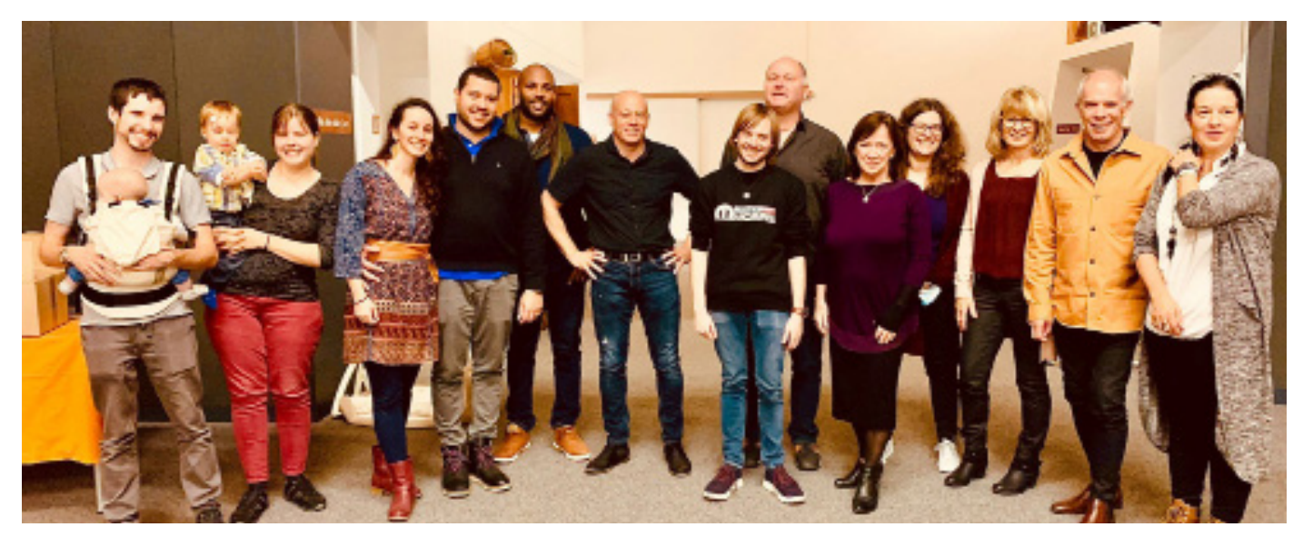
Staff of the Seminar in Tavannes Nov. 21

Here we have some testimonies from participants who experienced the gentle and powerful touch of the heavenly Father.